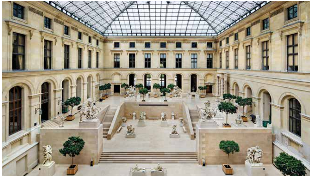
Originally a courtyard in the classic sense, Cour Marly was covered with a roof and transformed into an indoor sculpture garden. Most of the sculptures come from King Louis XIV's Chateau de Marly