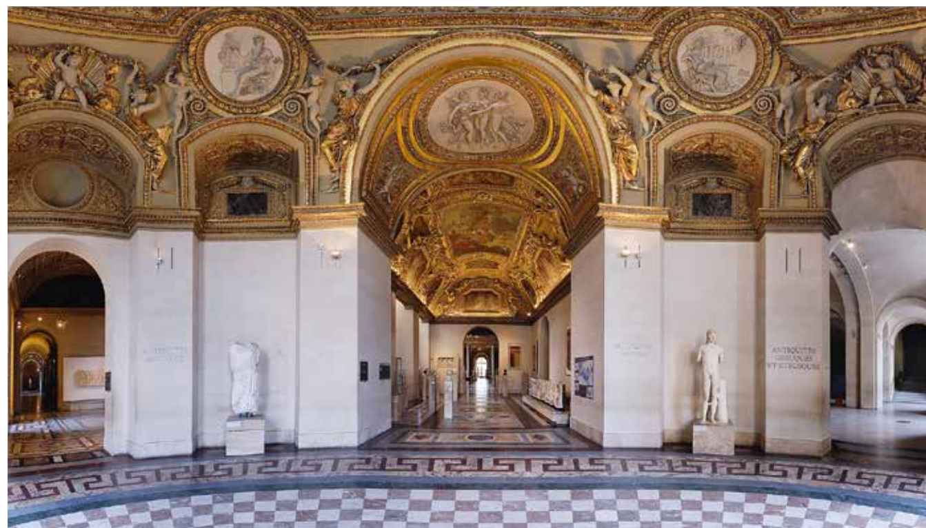
The names of the Louvre Endowment Fund’s major donors are engraved on the walls of the Rotonde de Mars for eternity.