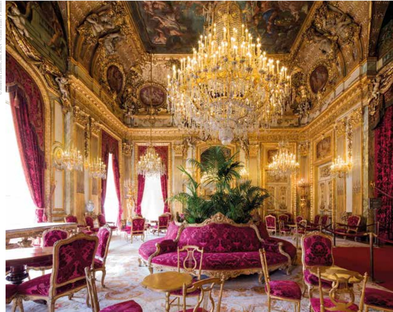
The large drawing room of the Napoleon III Apartments typifies the taste of the period for opulent interiors and is an exceptional record of Second Empire decorative art.