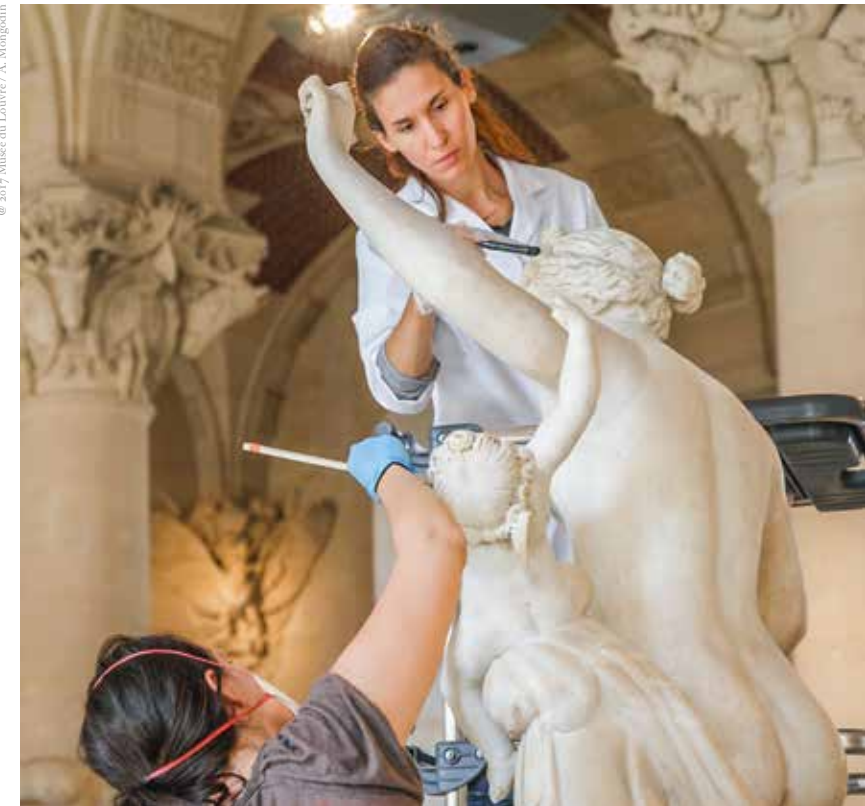
The Louvre Endowment Fund contributes through collective and dedicated funds to the preservation of the Louvre's collections and Palace.

The curators of the Louvre are well-trained specialists, including many leading experts in their fields. They conduct ongoing research on the collections and regularly publish articles and books in association with the Louvre's publication service that contribute to the advancement of knowledge on art history and archaeology. The Louvre Palace houses a laboratory, the C2RMF, for the study and restoration of its collections which contains the only electrostatic accelerator in the world devoted to the study of works of art. The C2RMF conducts scientific studies for the Louvre and other French museums, frequently collaborating with international museums. The Auditorium of the Louvre, built by I.M. Pei during the construction of the "Grand Louvre," accommodates more than 400 people. It offers conferences and round-table discussions aimed at the scholarly community and the general public, alike highlighting the Louvre's research programs.