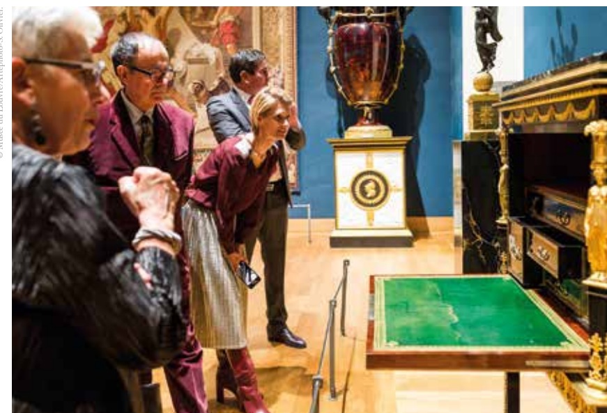
A private tour of the Decorative Arts Department for patrons.