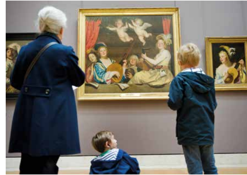
Educational programs for families are supported through dedicated funds within the Louvre Endowment Fund.

Further, an important component of the Pyramid Project, launched in 2014 to improve visitor experience, is the creation of new labels for all of the 35,000 works of art on display at the Louvre in English and French, and the installation of new information panels in French, English and Spanish. Access is also facilitated by the digitization of the collections, which has enabled people to learn about the Louvre's fantastic resources.