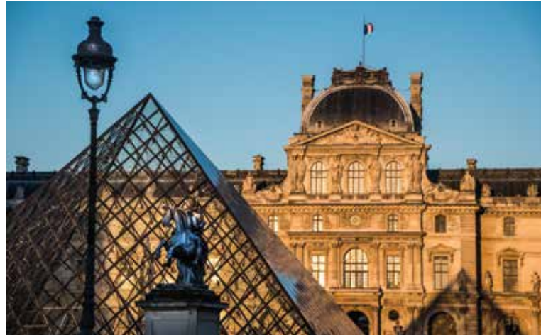
In the Louvre Palace, periods and styles have a continuing dialogue. The Clock Pavilion built during the Renaissance faces the famous Pyramid built in 1989 by I.M. Pei.