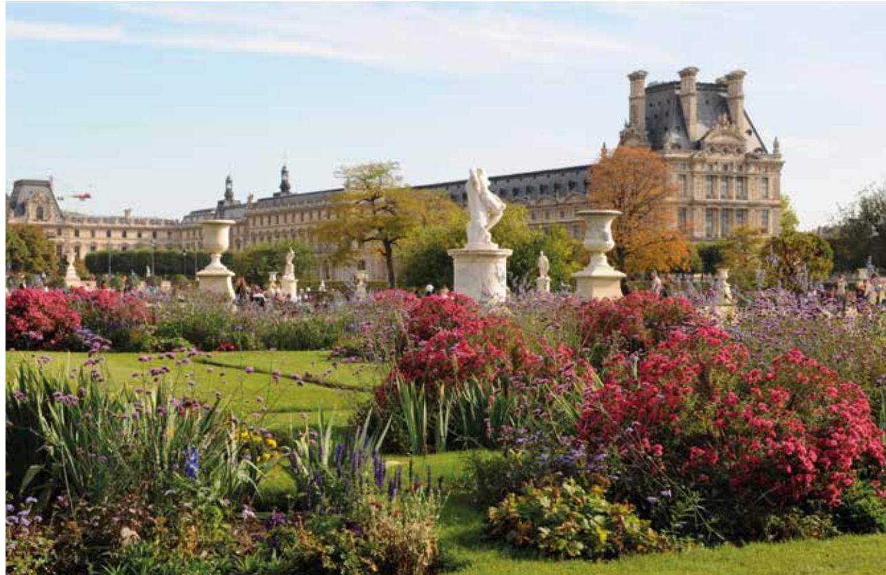
The Tuileries Garden was originally commissioned by Queen Catherine de Medici when she built the Palais des Tuileries in 1564. André Le Nôtre, the famous gardener of King Louis XIV, re-landscaped the gardens in 1664 to give them their current French formal garden style.