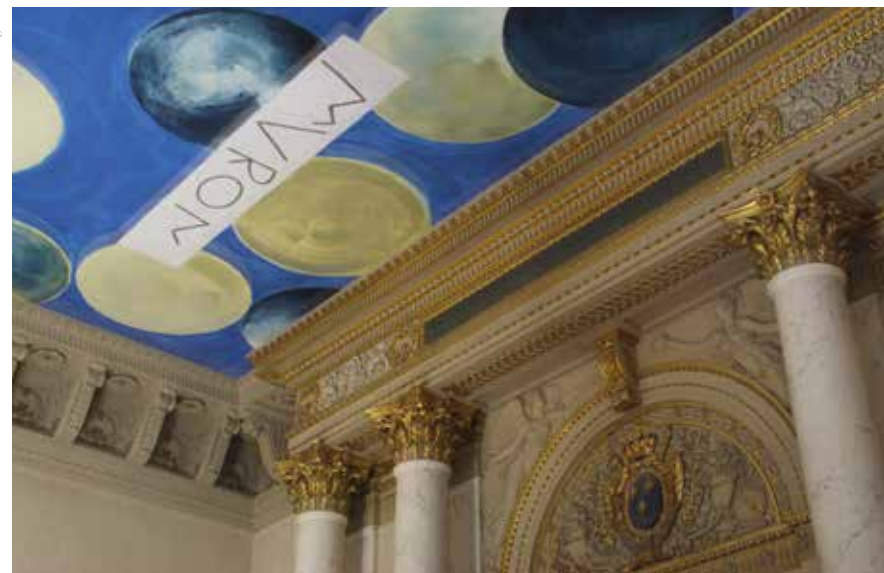
Cy Twombly, The Ceiling . The Louvre Palace has benefited from the intervention of great artists throughout its history and the Musée du Louvre continues today this tradition of commissions from contemporary artists.

To date, more than $32 million has been committed to benefit the Louvre's eight curatorial departments as well as the Education Department, Auditorium and Louvre Endowment. Initiatives supported range from scholarly research to gallery renovations, exhibitions and educational tools, and also include contemporary art installations, restorations and acquisitions.